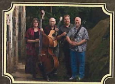
SKEETER AND THE SKIDMARKS