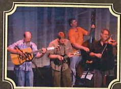
THE MOUNTAIN HOME BLUEGRASS BOYS