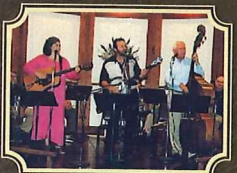
STRICTLY CLEAN &amp; DECENT